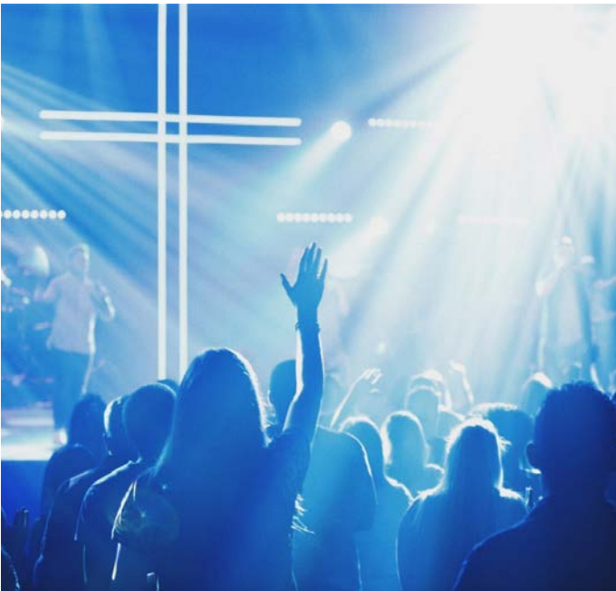
Grace Church, Humble