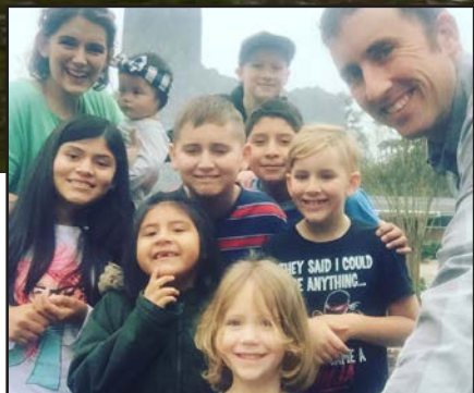
One couple's story of how missions begins at home...literally.